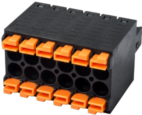
Twin connectors design, the pole number is half of the total connection points. photo shows a 12 connection product, the pole number is 06.